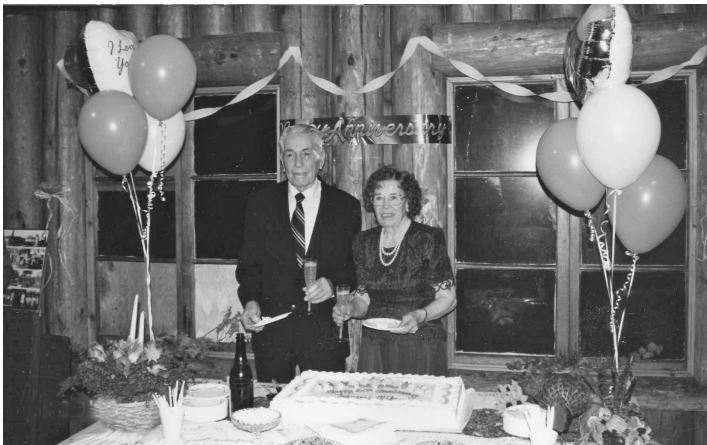
November 30, 1996 – 60 th Anniversary at Grants Pass, Oregon