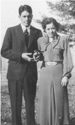
November 26, 1936 Wedding at Grants Pass, Oregon